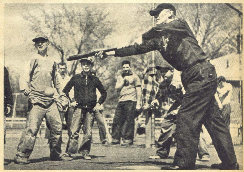
Nearly every officer participates in activities for Springfield children. The big event is an annual Christmas party, complete with presents and Santa Claus.