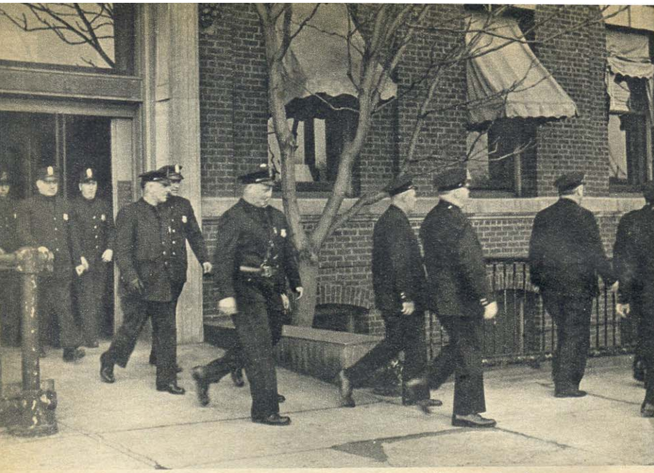
Three times a day, as the shift changes, police patrols leave headquarters.

This is a typical scene in a typical American city—the police shift is changing. These men, ordinary citizens themselves, are setting forth to guard other citizens from the crime, carelessness, and mischief that regularly tangle the everyday affairs of a modern, thriving community. Where once a lone town constable could handle Springfield's trifling crime problems, it now takes 302 officers, 125 auxiliary police, and countless specialists to solve the complex problems of maintaining law and order.