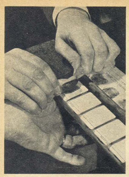
The fingerprints of every known criminal in the area are registered in this file.