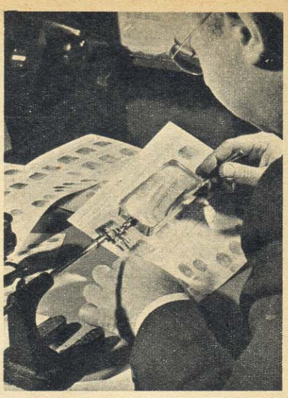
Every print is sent to the F.B.I. Five members of the force are print experts.